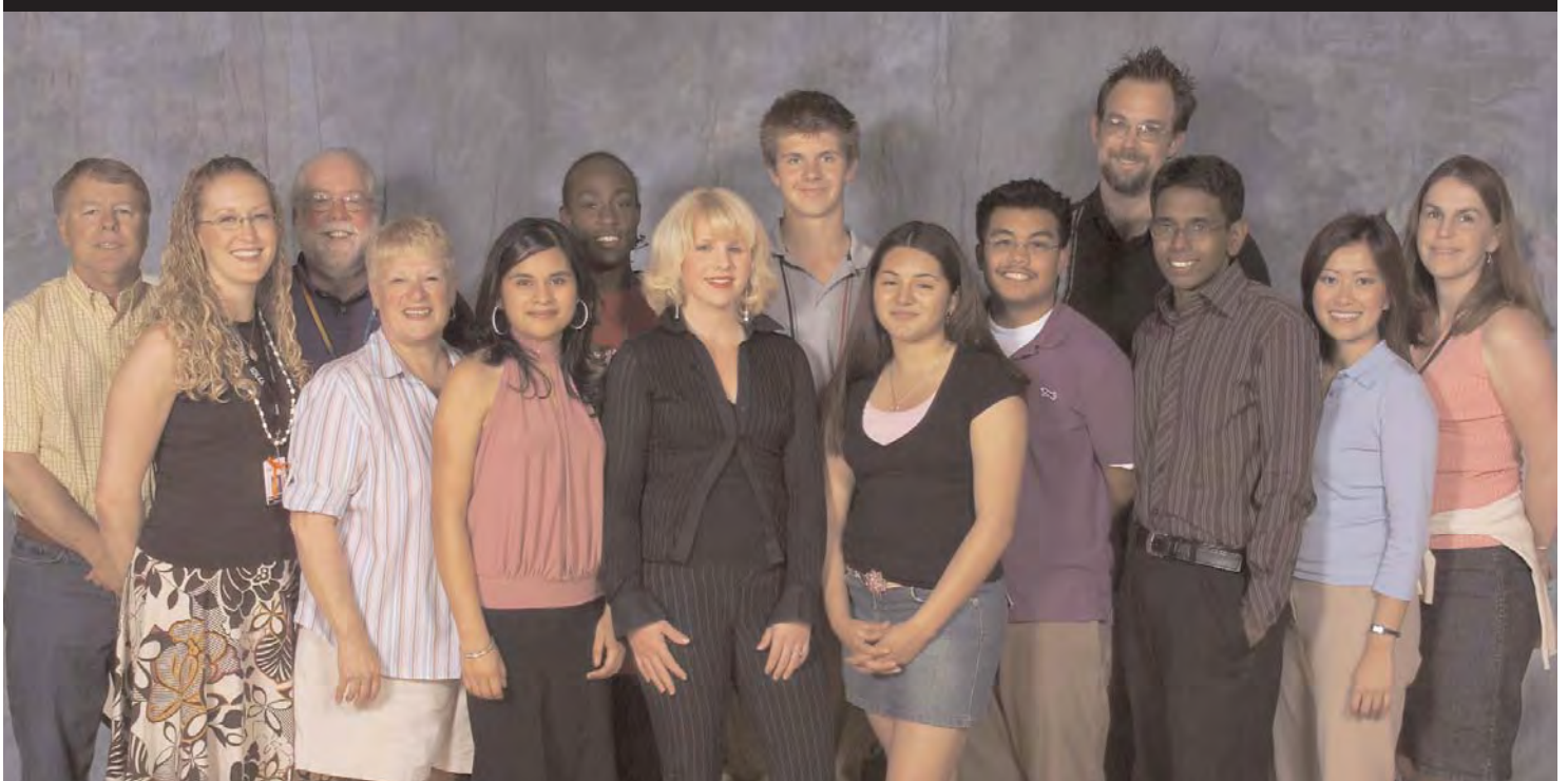
Recipients of the 2006-2007 high school scholarships (with teachers on the scholarship committee).