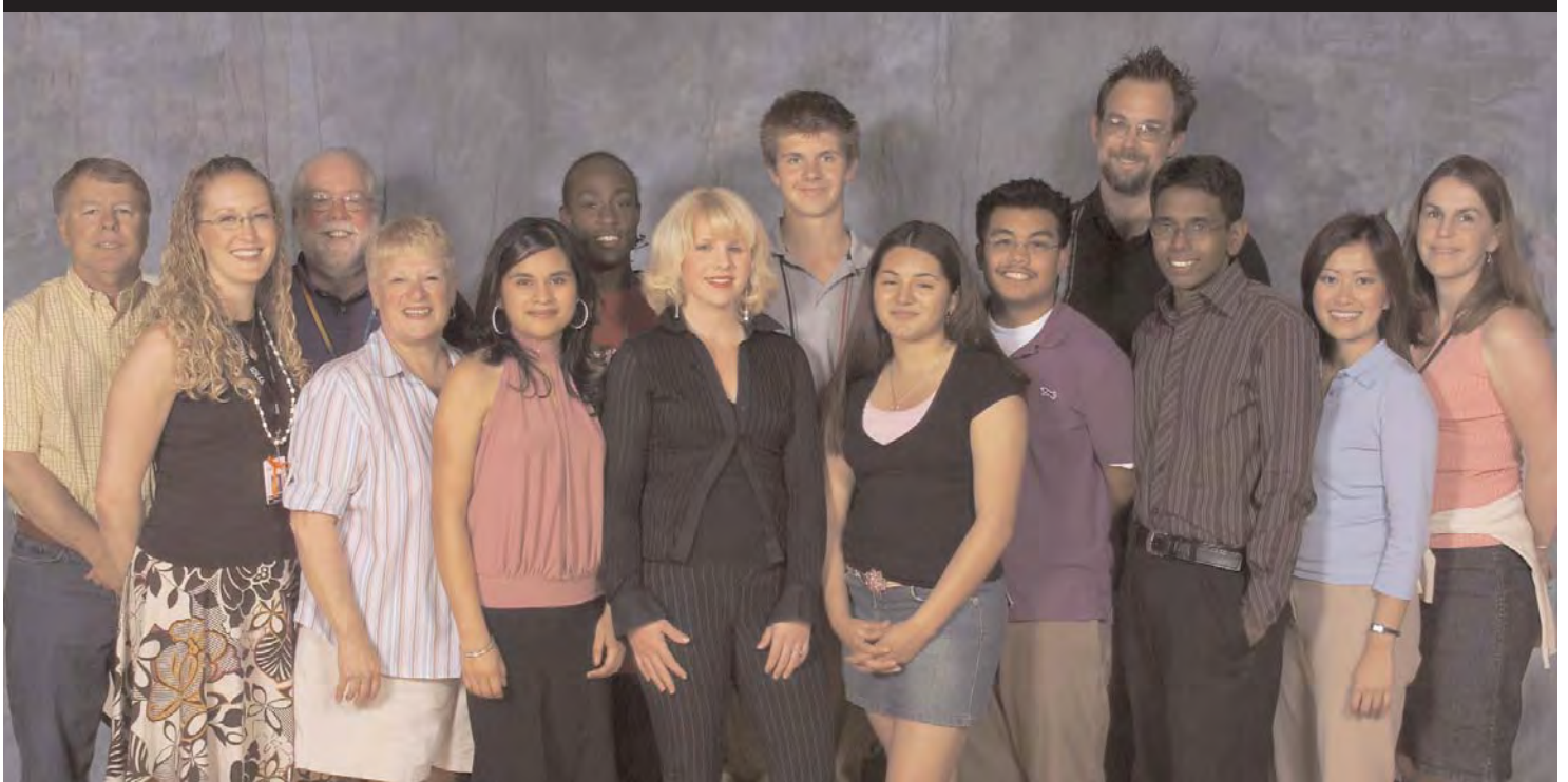
Recipients of the 2006-2007 high school scholarships (with teachers on the scholarship committee).