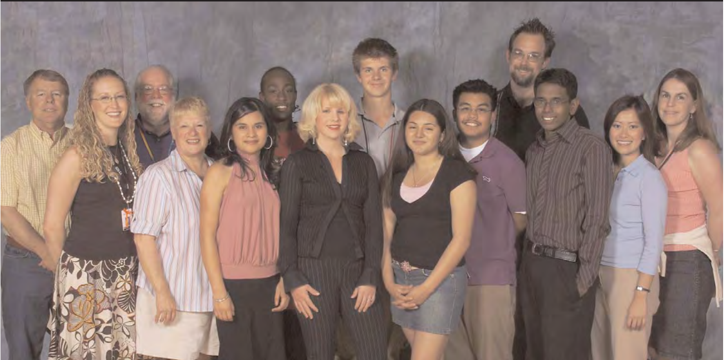
Recipients of the 2006-2007 high school scholarships (with teachers on the scholarship committee).